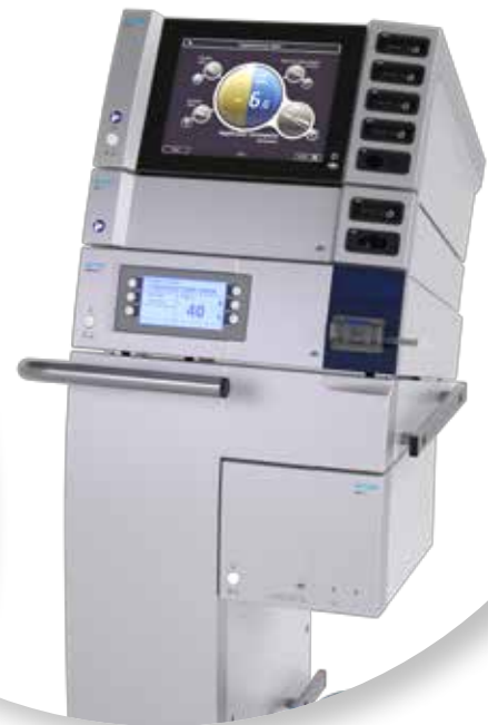
Surgery Workstation VIO® 3, APC 3, ERBEJET® 2, ESM 2