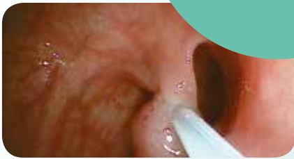
Polypectomy with endoCUT® Q

90 % of all users consider VIO® 3 to be easier to operate 1