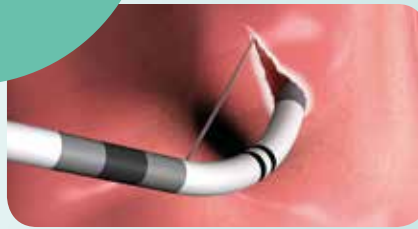
Papillotomy with endoCUT® I