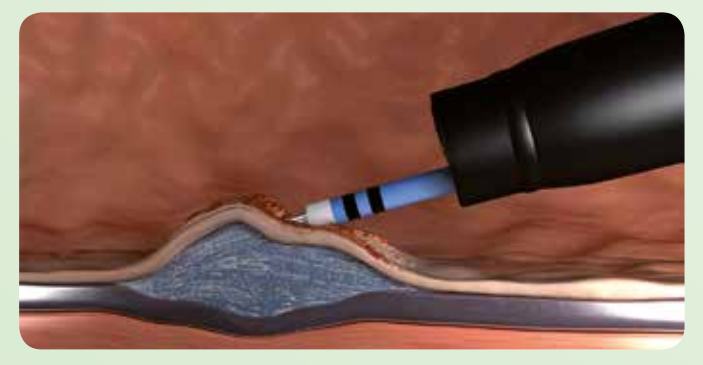
Fig 2: Elevation: Before endoscopic submucosal dissection (ESD) using electrosurgery, the mucosa is raised via the waterjet function. The HybridKnife® makes ESD simpler and safer.