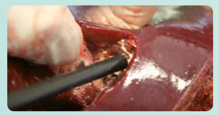
Electrosurgery and hydrosurgery integrated in one instrument (e.g. for liver surgery)