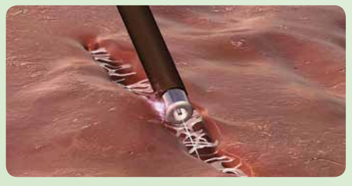
Fig. 1: Selective dissection: The waterjet function of the applicator reveals vessels which may be selectively coagulated using electrosurgery (example: liver surgery).

Hydrosurgery has been successfully used in medicine for many years. Tissue structures are dissected selectively and gently by waterjet. Blood vessels and nerves remain intact up to a certain pressure. Thereafter, vessels may be treated according to with their size. Waterjet elevation can also be used to create fluid cushions in the tissue and to separate anatomical layers from one another.