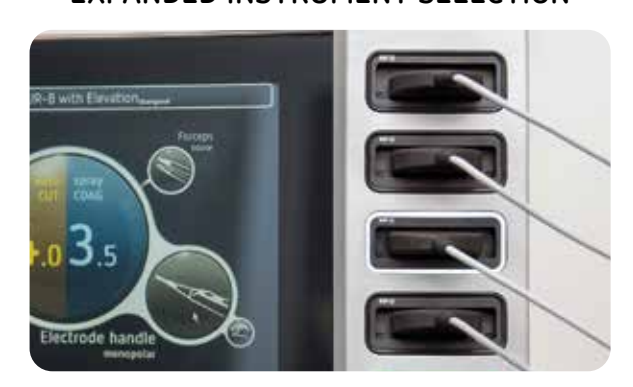
4 monopolar, 4 bipolar, 4 plug & play instruments (e.g. BiClamp®) or any combination thereof.