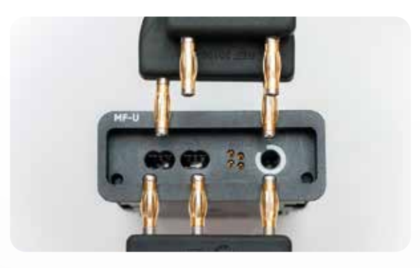
Standard instruments can be inserted into any universal socket.